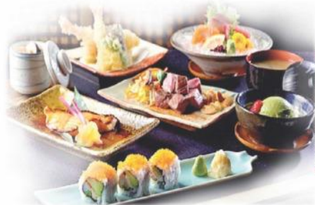
All images are for illustration purposes only.

Chef's Special Dessert Allergens : Gluten, Eggs, Nuts and Dairy